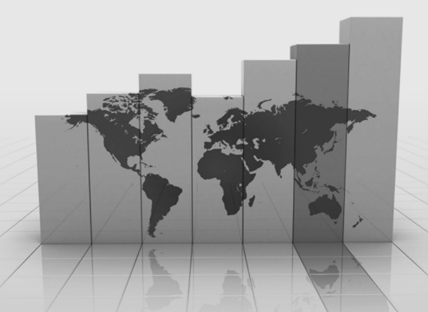
■. The Sino-American Relationship and U.S. Foreign Policy