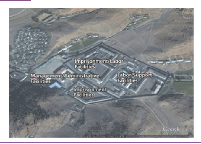
Figure II-4 Satellite View of Gaecheon Kyohwaso

Gaecheon Kyohwaso is divided into male and female zones. The female zone is again divided into unlimited-term and limitedterm zones in which prisoners sentenced to unlimited-term correctional labor punishment and limited-term correctional labor punishment reside respectively.<sup>57</sup> Testimonies indicate that female unlimited-term and limited-term areas are in separate buildings.<sup>58</sup>