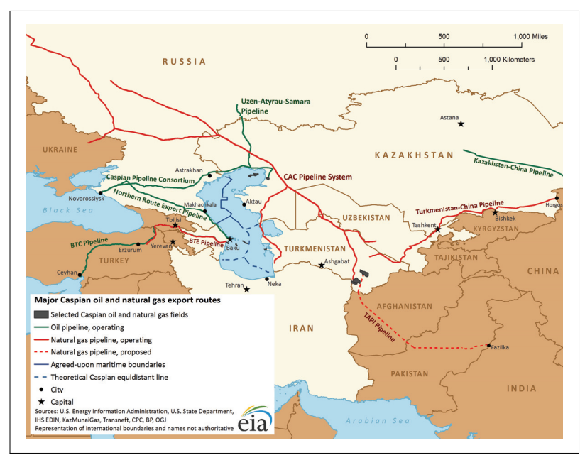
Figure VI-1 Oil and gas pipelines in Central Asia

* Source: <a href="http://www.eia.gov/countries/regions-topics.cfm?fips=csr">http://www.eia.gov/countries/regions-topics.cfm?fips=csr</a>.